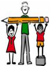
Meeting Needs of Students With IEPs

Goal: Continue to increase collaboration between general education and special education teachers to systematically monitor the progress of students with IEPs.